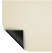
Video Spectra 1.5